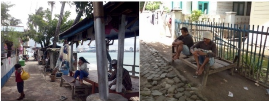
Figure 2. Communal Space Created by the Street Side

The beach area is a communal space that is used as a parking lot for boats, manufacture and maintenance of boats / ships, for play, to socialize, for exercise, recreation, and even control the environment that might be affected by newcomers. There are several bale-bale in the area, almost all of them placed near the trees to get shade and fresh air. The illustration of communal space in Lae-lae island can be seen in Figure 2.