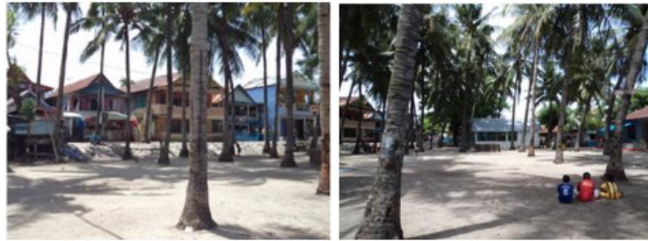
Figure 6. Green Open Space Used as a Playground and Camping Area

Pedestrian signs are planned with the aim of enjoying the beauty of the beach and enjoying the sunset and sunrise while cycling or walking around the island. A beautiful view of the ocean with the roar of the waves always provides peace and comfort, especially for elderly tourists (Maryani 2 008). This is a kind of nature tourism or eco-tourism, to a place where nature is relatively undisturbed or contaminated (polluted) with the 2 objective of studying, admiring and enjoying the scenery, vegetation and wildlife, as well as forms of cultural manifestations, both from the past and the present (Hani, et al 2010)