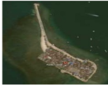
Figure 1. Lae-Lae Island

In their daily life, people on the island of Lae-Lae spend more time in open spaces. Various activities do not take place in the house but in the yard, the street, beaches, and other open places. Diverse activities are conducted in these places, where there are playing, working, resting, eating, parenting, or just socializing with neighbors. In these places, they put bale-bale as seats and the placement is generally under the big tree.