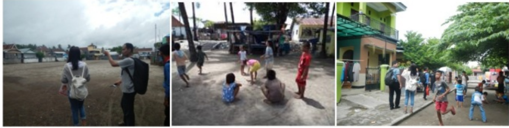
Figure 3. Football Field and Green Open Spaces