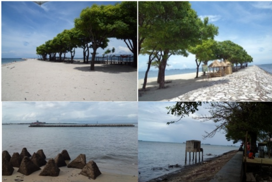
Figure 4. Sea Wall Which Developed into a Recreational Beach and the Row of Tammamate Trees

Currently, there are tourist attractions which are north of the island. Originally the area was a seawall intended for the protection of the Makassar city from the surf. Over the years, the west area of the seawall has experienced sedimentation and developed into the beach and is currently visited by many residents for recreation. There are several buildings made of bamboo lining the place and used by tourists for resting. Similarly, the row of tammamate trees / Jawa-jawa are giving shade and a comfortable atmosphere in the area. The illustration of sea wall which had been developed and the row of tammamate trees can be seen in Figure 4.