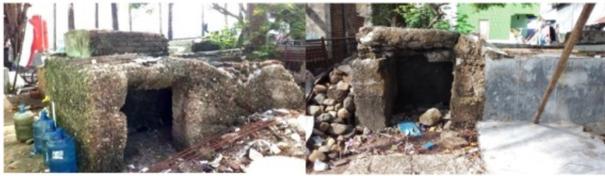
Figure 7. Japanese Caves as Cultural Heritage Tourism

Lae-Lae Island can also be developed for culture and heritage tourism, where the tourism can see and feel the state of the masses, habits, and customs, way of life, culture and art of the local people, besides the places that are considered sacred, called saukang , and caves. The Japanese caves in Lae-Lae island can be seen in figure 7.