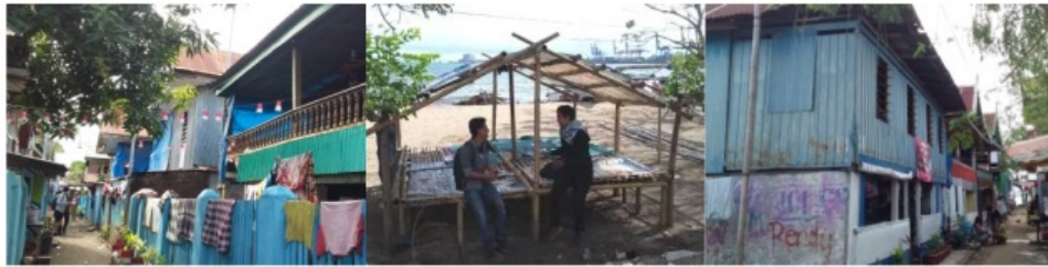
Figure 9. Nature Tourism

The Japanese cave has historical value. Based on research conducted by PATA in 1961 in North America, for more than 50% of foreign tourists who visit the Asia and Pacific regions, the motivation of their travel is to look and see the customs, the way of life, historical heritage, ancient buildings and buildings of high value. According to the study Tourism Citra Indonesia in 2003, cultural tourism is the element that most attracts foreign tourists to come to Indonesia. Getting a score of 42.33 foreign tourists placed culture in the category of 'very interesting' and on top of other elements such as natural beauty and historical heritage, with a score of 39.42 and 30.86 respectively. This demonstrates cultural attractions as the most favored by tourists from tourism in Indonesia. Therefore, the condition of this Japanese cave needs to be re-organized to make it more attractive