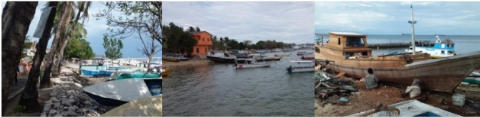
Figure 8. Social Life and Culture Tourism

In another part of the island, there is a Japanese cave which according to citizens' information was a Japanese relic cave, providing a passage to the mainland of Makassar city. But the condition of the cave is very poor, as it was used as a garbage dump by the local people. These items can be developed for heritage tourism. The illustration of social life and culture tourism can be seen in figure 8, while the nature tourism can be seen in figure 9.